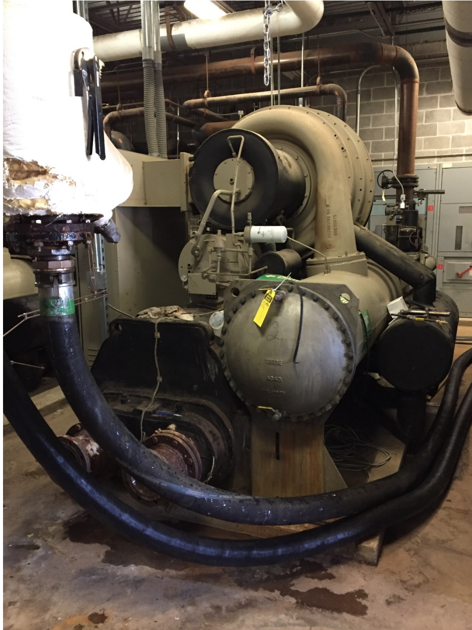
MCUD5 NCWHS CHILLER #2 PHOTO 1